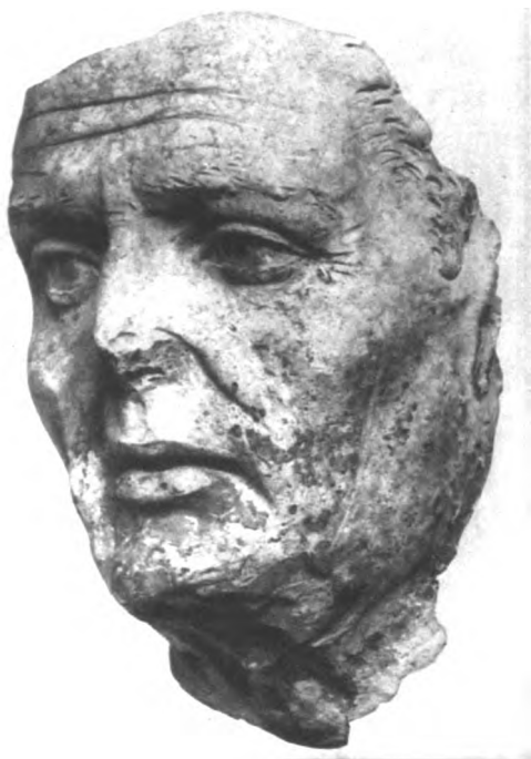
M. TULLIUS CICERO. FROM THE JAMES LOEB COLLECTION.